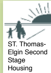
ST. Thomas-Elgin Second Stage Housing

Funds enabling donor participation in developing grant criteria and directing the distribution of income from their funds.